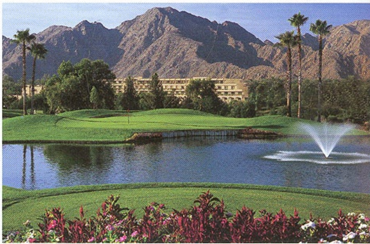
ABOVE: A view of the Coachella Valley at sunrise. RIGHT: The Hyatt Grand Champions Resort & Spa.